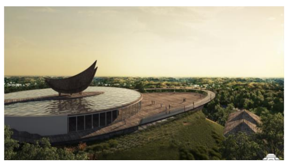
2018–2019 Xuan Khank Lake Masterplan @ Hanoi, Vietnam

Masterplan Design / Iconic Building Design / BIM Model Management / Rendering / BIM for Masterplaning / Task management / Rendering / Presentation / Workflow Management