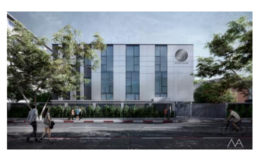
2021 Bowin Silver Factory

BIM Management / BIM Mode l& Drawing Package (AR / INT / ST ) / Clash Detection