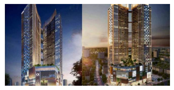
2018 Alpha 4 by Alpha King @ Ho Chi Minh, Vietnam

Construction Drawing Package / Main BIM modeler