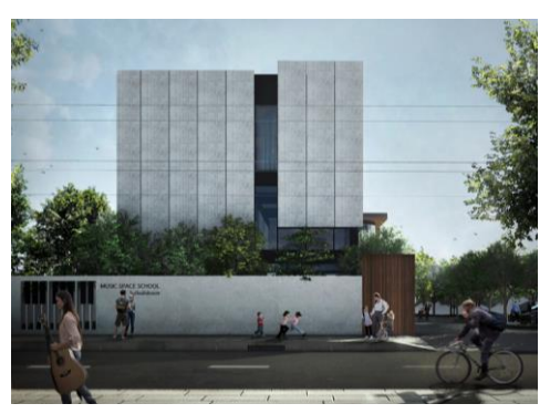
2021 Music School RAMA 2 Rd