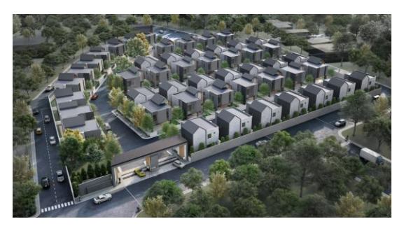
2022 PROJECT VILLAGE HUAHIN