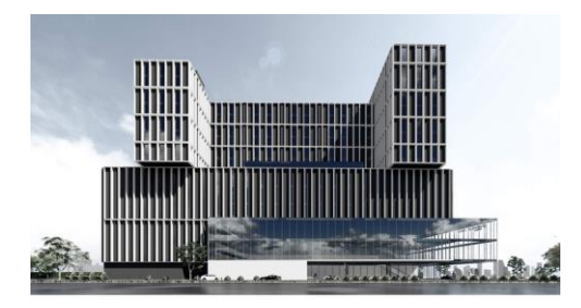
2021-Present Vipharam Onut Hospital

BIM Management / BIM Model & Drawing Package (AR / INT / LA) / Clash Detection