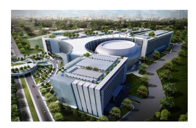
2019–2022 GOVERNMENT CENTER ZONE C

Masterplan Design / Iconic Building Design / BIM Model Management / Rendering / BIM for Masterplaning / Task management / Rendering / Presentation / Workflow Management