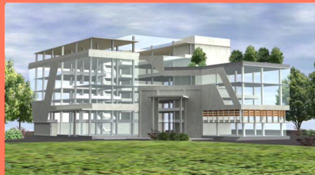
FACULTY OF ARCHITECTURE, EDUCATIONAL BUILDING