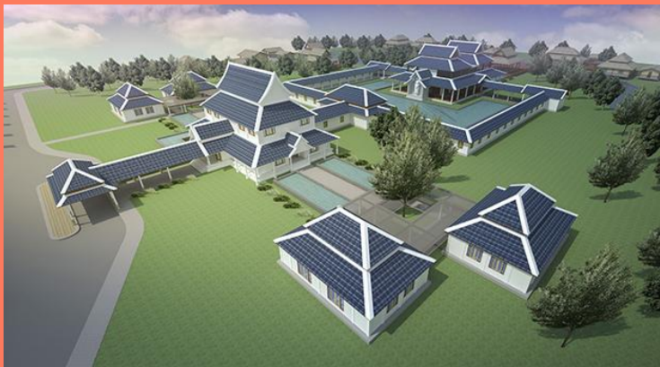
ARCHITECTURAL THESIS: MEDITATION CENTRE