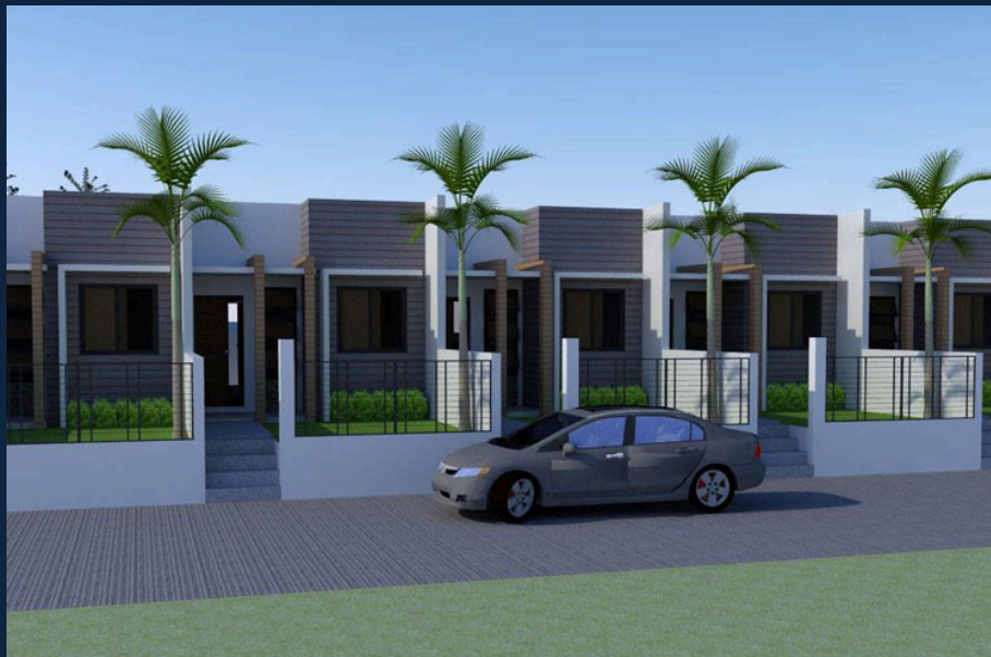
PERSPECTIVE 5 UNITS ROW HOUSE ST. MICHAEL SUBIVISION, PANACAN DAVAO CITY, PHILIPPINES