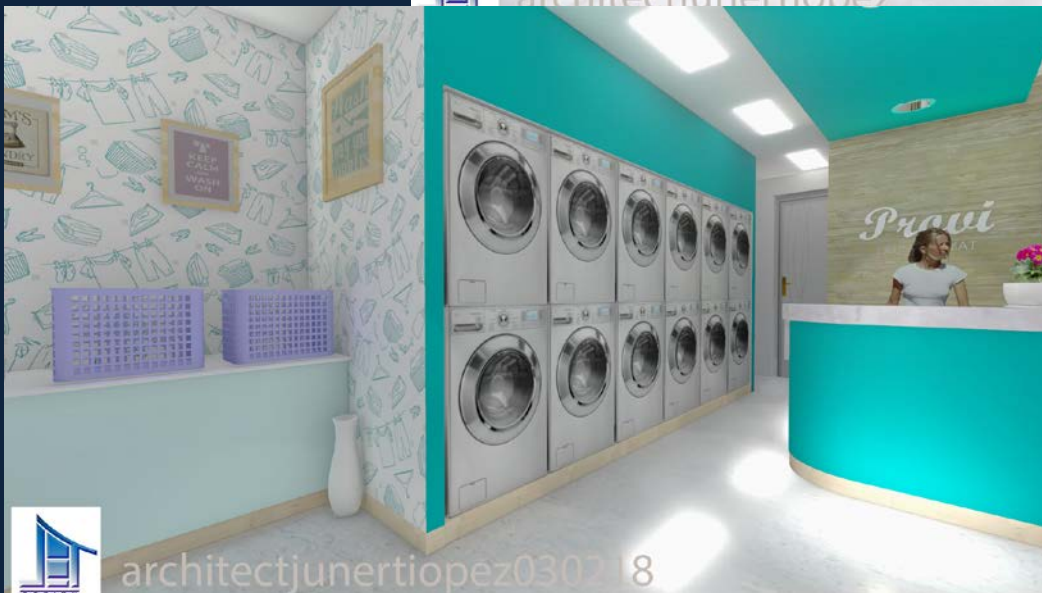
PROVI LAUNDROMAT CORNER RUBY, CORAL ST. MARFORI HEIGHTS SUBDIVISION, DAVAO CITY