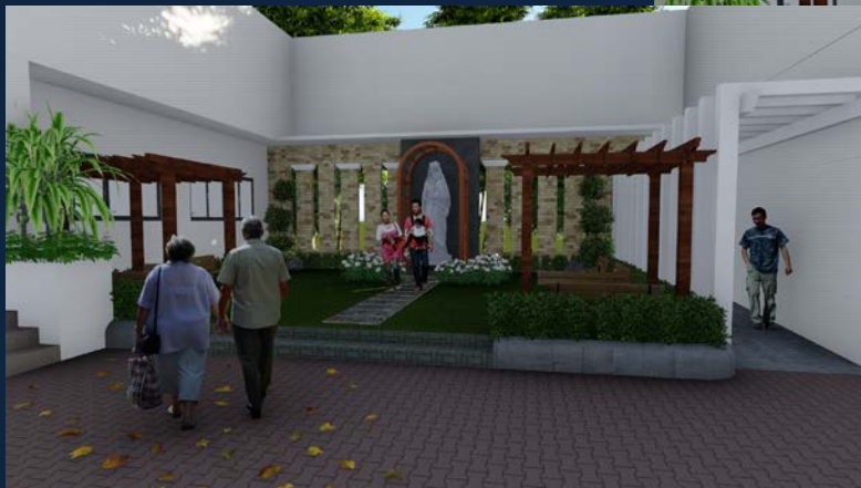
MARY HELP OF CHRISTIAN CHURCH PRAYER GARDEN