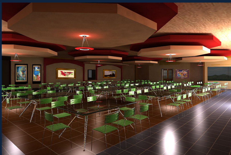
INTERIOR PERSPECTIVE IKOS GRILL RESTAURANT DAVAO CITY, PHILIPPINES