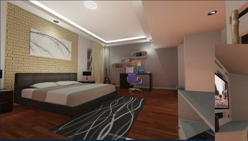
ADDITIONAL BEDROOM ,MOO BAN PRIVATE NIRVANA, WANGTHONGLANG, BANGKOK