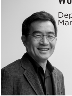
Deputy Managing Director