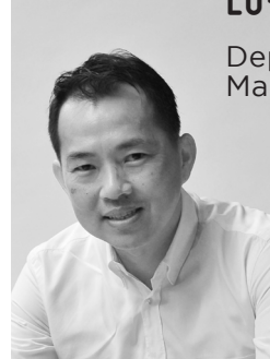
Deputy Managing Director